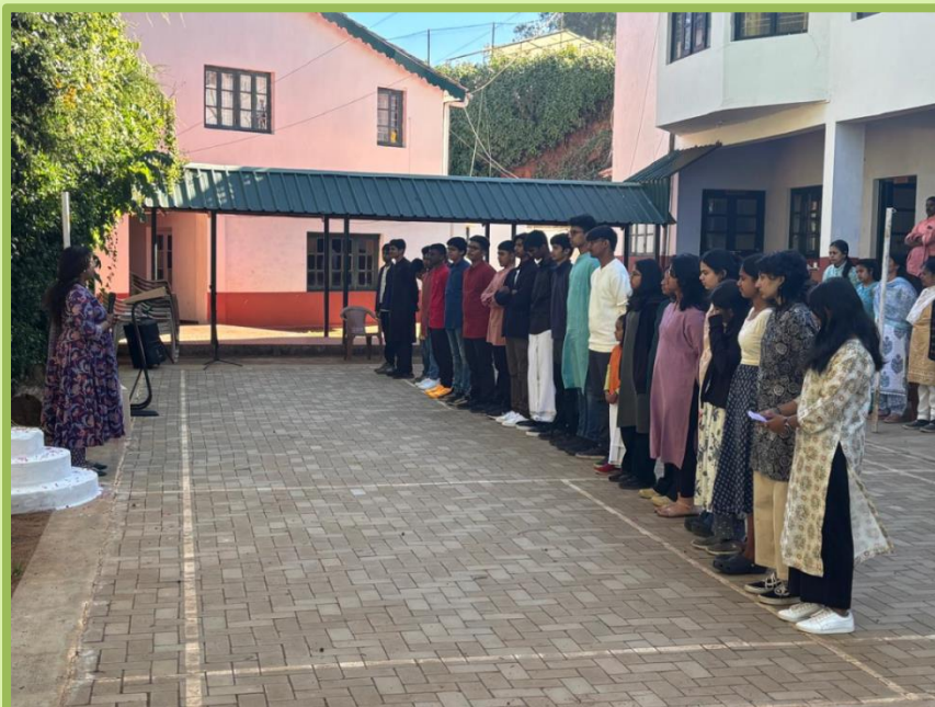
The Republic Day Celebration at BMS